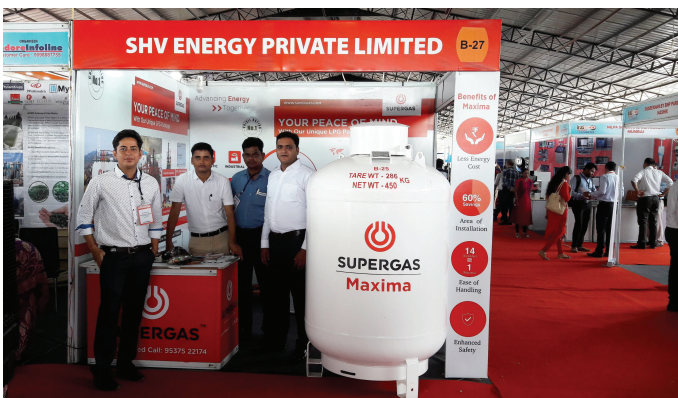
INDEXPO Exhibition @ Nashik, June 2018