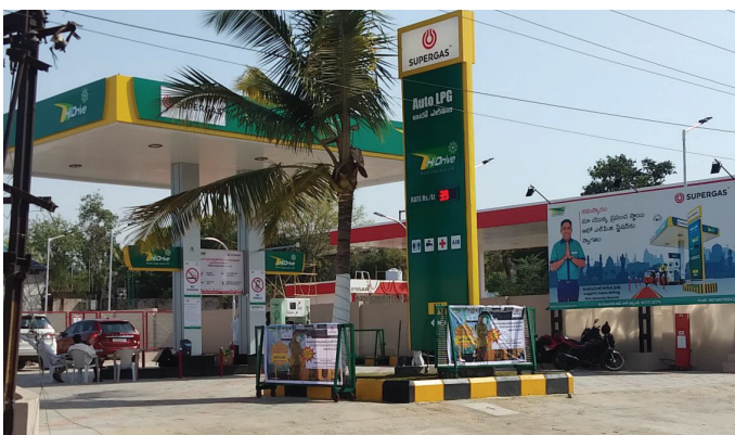
New Auto LPG Station @ Nacharam, Hyderabad