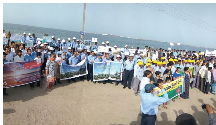
Porbandar Beach Cleaning Drive, May 2018