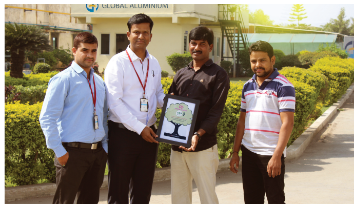
Our Happy Customer with Carbon Saving Certificate @Hyderabad.