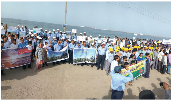
Porbandar Beach Cleaning Drive, May 2018