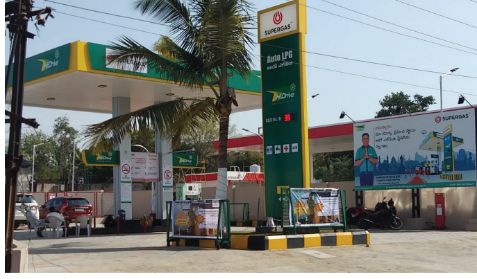
New Auto LPG Station @ Nacharam, Hyderabad