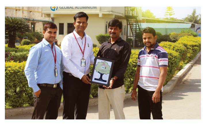
Our Happy Customer with Carbon Saving Certificate @Hyderabad.