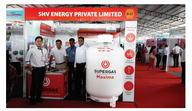
INDEXPO Exhibition @ Nashik, June 2018