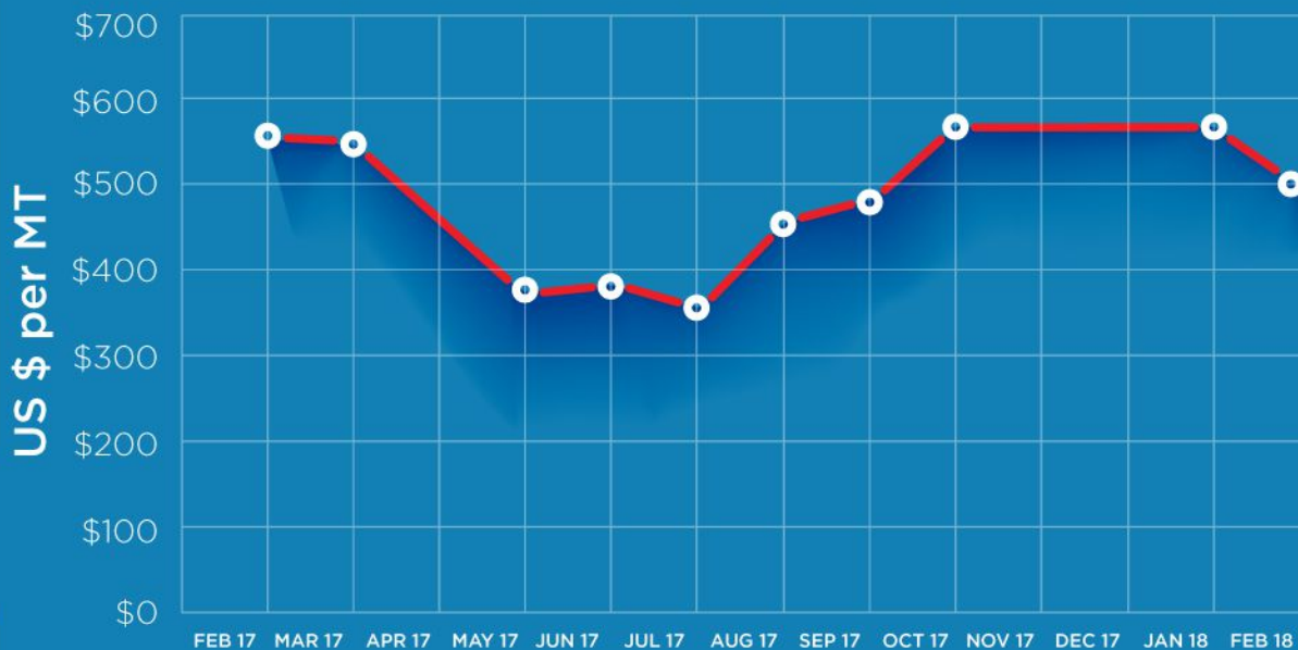
*Saudi Aramco CP for 40/60 mix

Crude Prices climbed to new heights in January, on the back of falling inventories, supply outages in Libya / North Sea, and geopolitical tensions. Brent touched a peak of $69 per Barrel by end Jan, a dip of $5 over Dec rates. Market sentiment was buoyed by large US stock draws, amidst a tighter global balance and news of good economic growth projections for 2018. However, the prices are already under pressure due to a confluence of factors including the