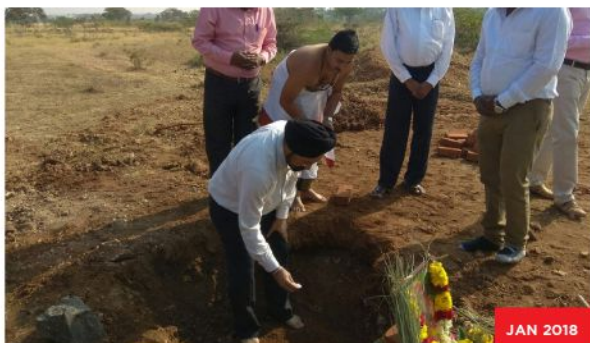
Infrastructure for on-time, every-time: Bhoomi Puja at Coimbatore New Filling Plant