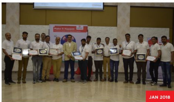
Progress through Partnership: Award winning Franchisees at Gujarat Franchisee Meet