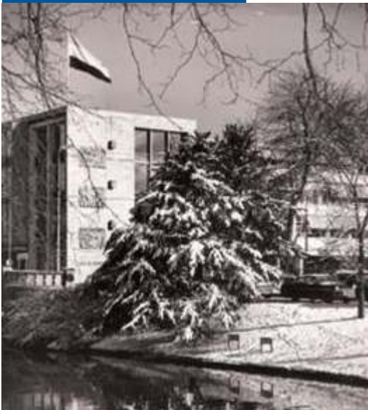
Winter in Utrecht, The Netherland, 1960