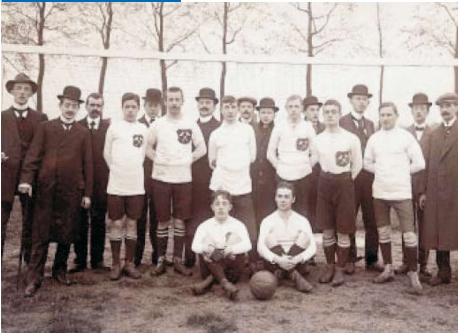
SHV Football Team, 1912