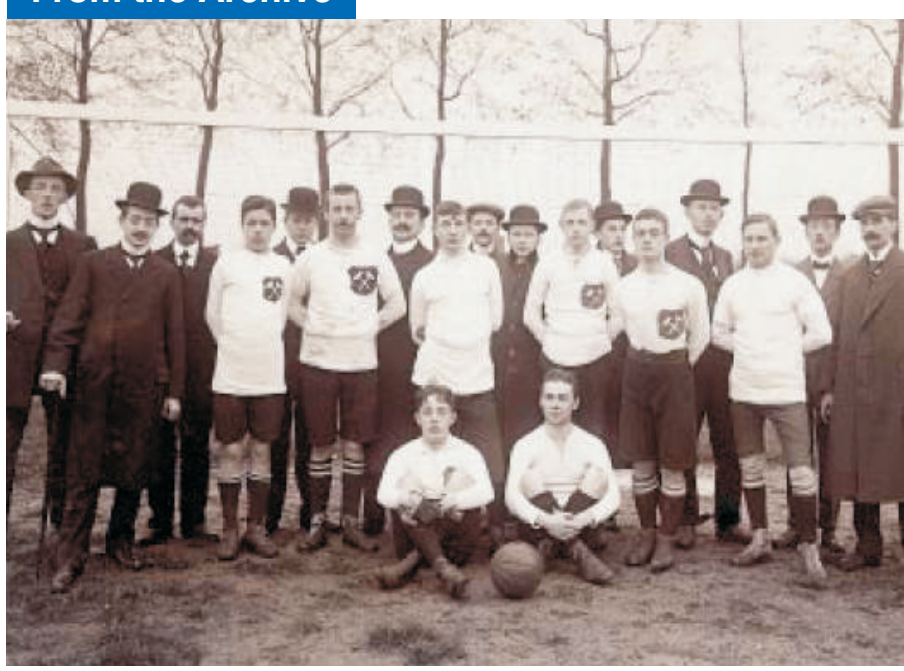
SHV Football Team, 1912