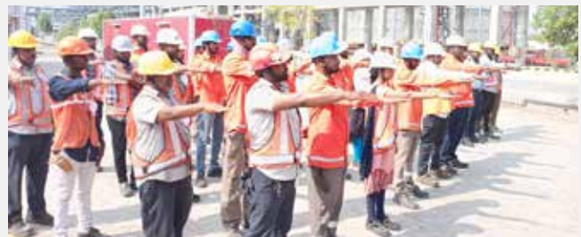
Safety Pledge at Tuticorin Terminal

We celebrated Health & Safety Week at SUPERGAS from 4 th to 10 th March 2024, themed "FOCUS ON SAFETY LEADERSHIP FOR E.S.G. EXCELLENCE." Emphasizing the integration of health & safety leadership with Environment Social Governance (ESG) principles, we conducted various activities. Highlights included training on SHVE's 9 Life Saving rules, First Aid/CPR training, and recognition for outstanding H&S practices by our technicians, operators, and contract workers. We also offered training on safe LPG handling to our customers across industrial, retail, and auto gas sectors, reinforcing our commitment to safety and sustainability.