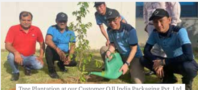
Tree Plantation at our Customer OJI India Packaging Pvt. Ltd.

From April 22 nd to 26 th , we've embarked on a journey of sustainability, education, and action! Tree planting initiatives across our filling plants, terminals, and at our esteemed customer locations to Creative drawing competition of our employee's children on the theme Planet Vs. Plastic, we have conducted various activities to empower ourselves. At SUPERGAS, our ambition goes beyond performance – it's about the people we serve and the planet we share.