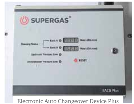
Electronic Auto Changeover Device Plus

This capability not only helps maintain efficiency but also ensures timely LPG ordering, avoiding any potential disruptions. This innovative addition inspires our ongoing commitment to innovation in LPG storage systems to enhance customer satisfaction.