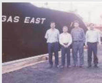
First Ship "Gas East" at Vishakhapatnam in 1998