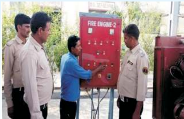
Security training at Rohtak Filling Plant