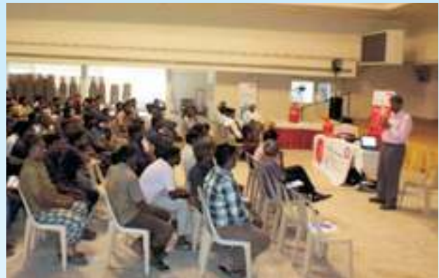
Delivery sales person safety training at Chennai