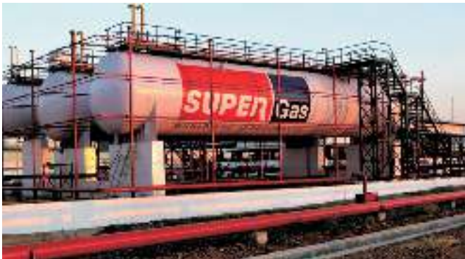
“Robust infrastructure in ensuring a Happy Customer”- Inauguration of Pune Filling Plant - Feb'2016