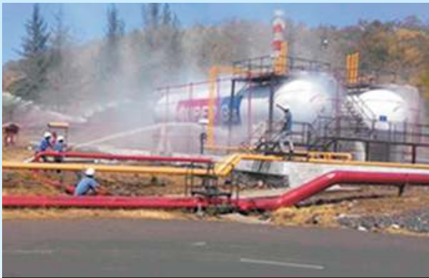
Safety mock drill at Murbad Filling Plant

We celebrated the Safety week from March 1 st to 5 th Customers, transporters, statutory authorities, employees and other stake holders in the business were involved in this event and they appreciated this initiative.