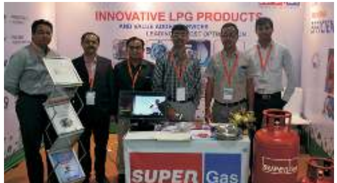
Reaching out to customers, vendors and users at CII's BIZ Bridge event at Kolkata organised by CII ( Dec-2015)