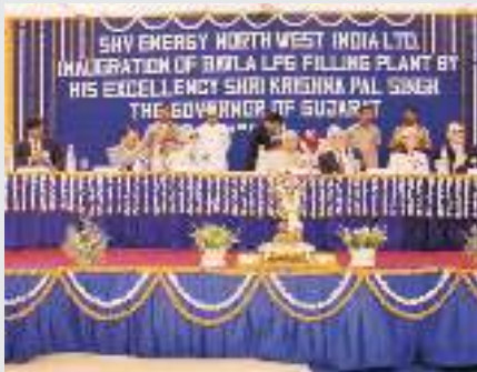
Inauguration of Bavla LPG filling plant in 1998