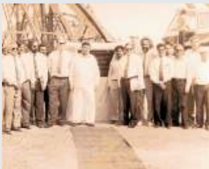
Laying of foundation stone for Porbandar Terminal by Port minister in 1997

Customers, Partners, People and We. Can we take a flashback? Wow... we are going through this exciting journey of serving energy solutions through LPG for the last 20 years. Thank you all for your patronage and we look ahead to serve Customers better and together.