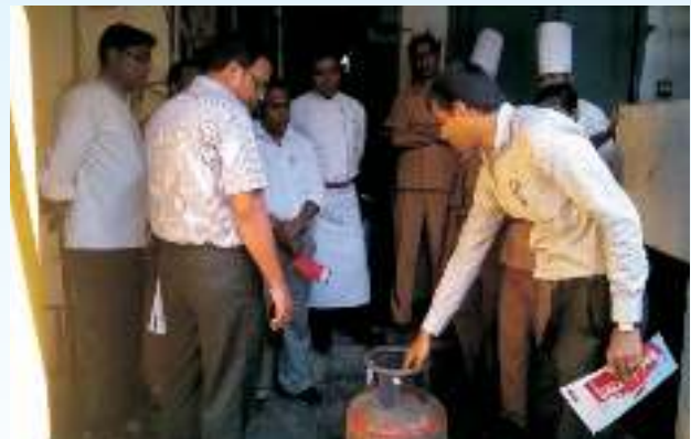
Safety Training at Commercial Customer, Kolkata