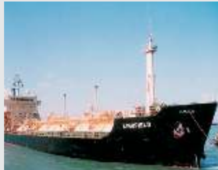
Receipt of first ship "Gas Lingfield" at Porbandar- 2001