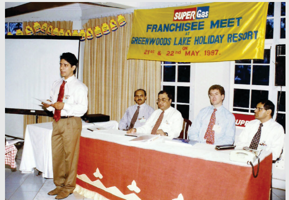
Progress through Partnership Franchisee Meet of West Region Ahmedabad - May, 1997