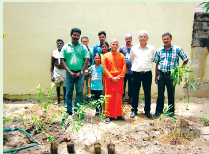
Tree plantation at the Ramakrishna Ashram, Chennai (South Region)