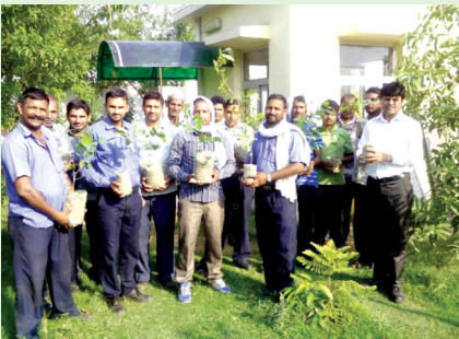
Tree Plantation at Rohtak Filling Plant (North Region)

SUPER Gas celebrated World Environment Day on June 5 to bring in significant change towards environment awareness within the Company, to its stake holders and to the community as a whole for a noble cause of saving our beautiful planet.