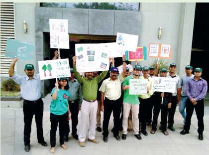
World Environment Day Celebration at our Ahmedabad Office (West Region)