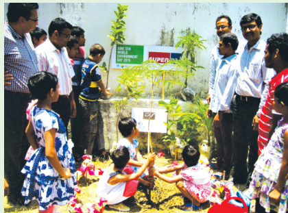
Tree Plantation in APANGHAR, a differently - able school in Kolkata (East Region)