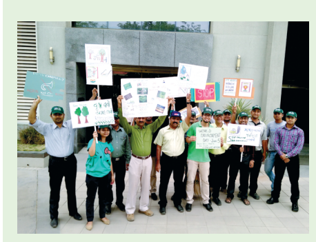
World Environment Day Celebration at our Ahmedabad Office (West Region)