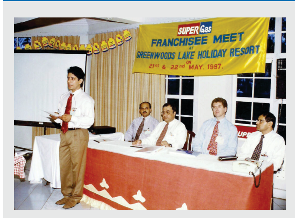
Progress through Partnership Franchisee Meet of West Region Ahmedabad - May, 1997