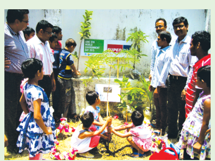
Tree Plantation in APANGHAR, a differently - able school in Kolkata (East Region)