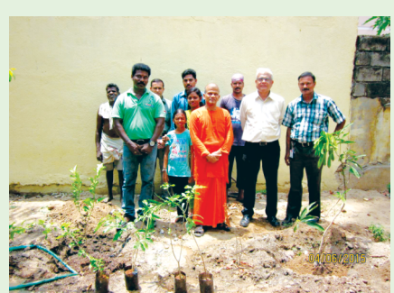
Tree plantation at the Ramakrishna Ashram, Chennai (South Region)