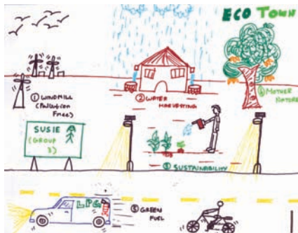
Drawing competition on Sustainability