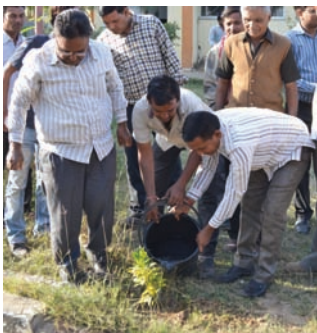
Sapling plantation by our Transport crew.

Green Leaf, the Sustainability team of West Region has initiated activities to improve the environment and generate awareness for a sustainable life. Our business partners, transporters and family member are also a part in this drive.