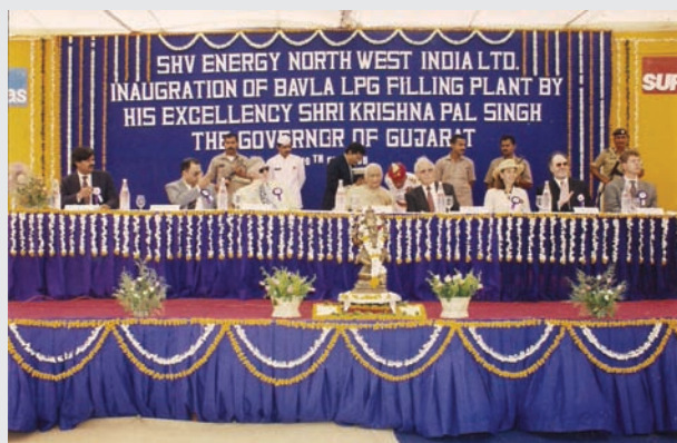
Inauguration of Bavla Filling Plant near Ahmedabad by Governor of Gujarat -Feb, 1998