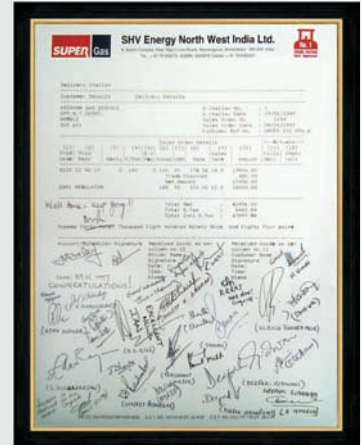
SHV India's First Invoice June, 1997