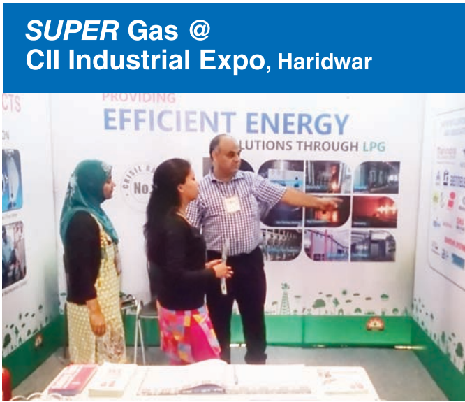
SUPER Gas @ CII Industrial Expo, Haridwar