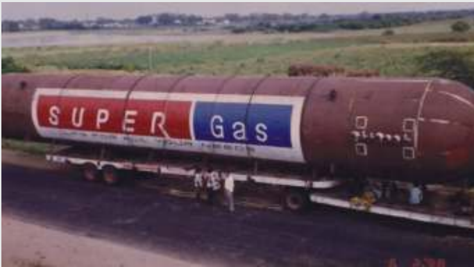
Transportation of LPG Storage Bullet to Peddapuram Filling Plant - 1998