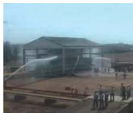
Mock drill at Porbandar Terminal, Gujarat