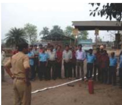
Demonstration by fire inspector at Uluberia Filling Plant