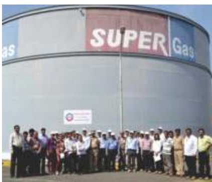
Offsite mock drill with Govt. Authority-Bavla Plant