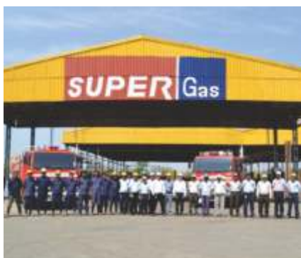
Offsite mock drill with Govt. Authority - Bavla Plant