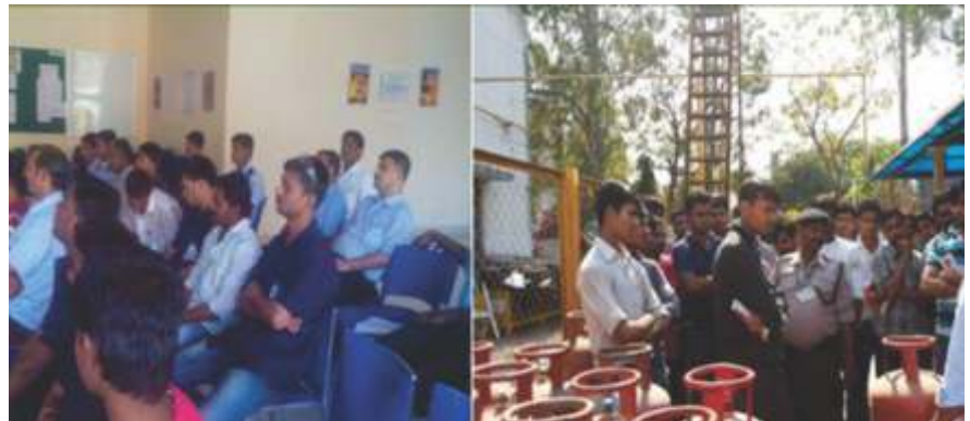
Safety Training programmes organized at Commercial and Industrial customer, Ahmedabad.