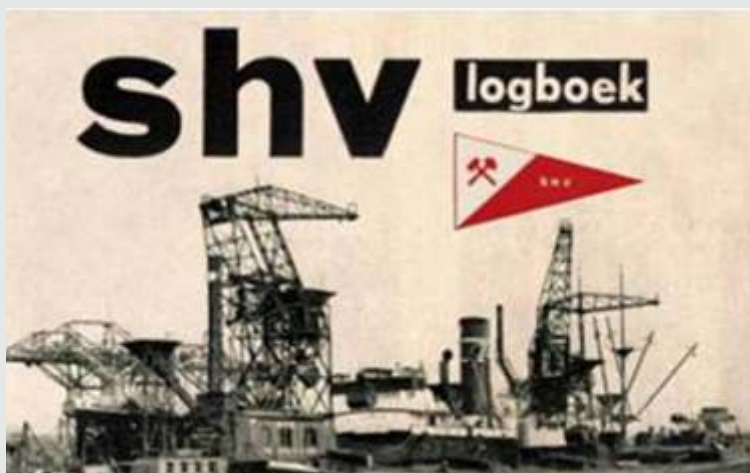
SHV, established in 1896, has a rich History. The above image is the SHV logbook in the first year.