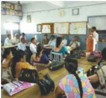
Safety Training to teaching staff at Shakti High School, Ahmedabad.