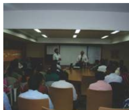
Safety Training at SHV India corporate office, Hyderabad.