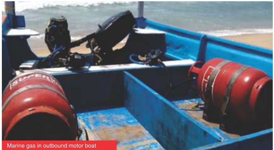
Marine gas in outbound motor boat

Marine Gas cylinders have been designed exclusively keeping the ambient conditions in mind with application of special paint for preventing corrosion and other safety features.