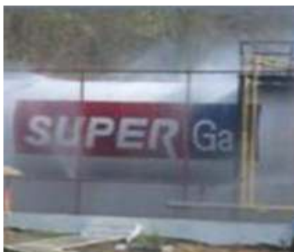
Offsite mock drill at Murbad Filling Plant