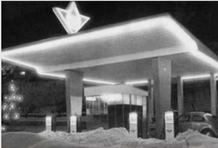
Light in the dark of winter