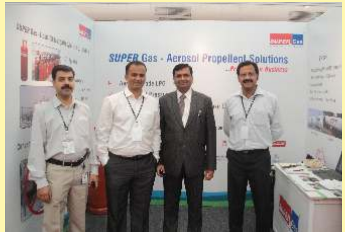
SUPER Gas team with visitors at ILC 2012 - Exhibition