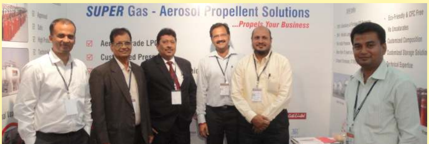
SUPER Gas at Aerosol Promotion Council - International Liaison Committee (ILC) Exhibition Nov' 2012, Mumbai.

We provide safe and efficient bulk LPG installations with technical support and services starting from initial setup phase of the project till the start of production. For more details SMS SUPERGAS to 56070 or visit our website www.supergas.com