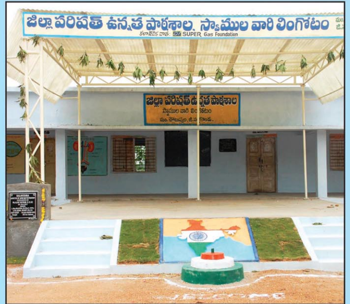
► multi-purpose stage