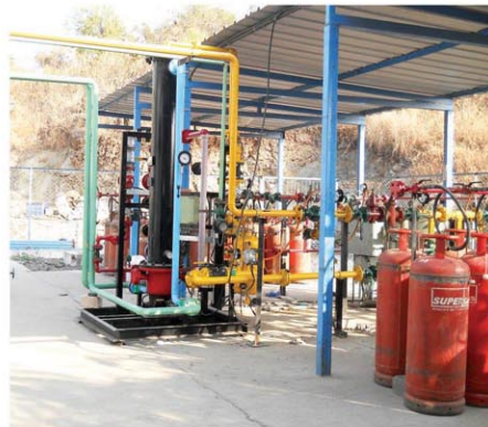
► Heater Less Vaporizer

The heat exchanger works on continuous flow of water in ambient temperature from a water storage tank in a closed loop