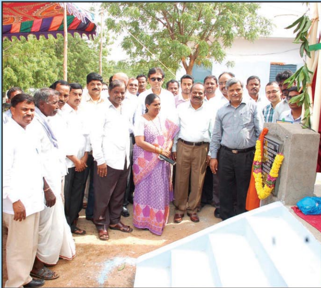
► Inauguration of multi-purpose stage

achieving the objectives and giving back to the communities we live in. For further details, you may contact sreeman@supergasfoundation.com or visit www.supergas.com