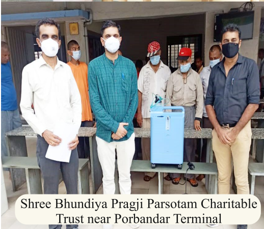
Shree Bhundiya Pragji Parsotam Charitable Trust near Porbandar Terminal