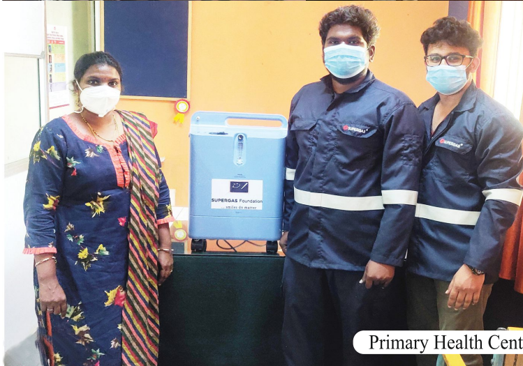
Primary Health Centres near Kolar Filling Plant