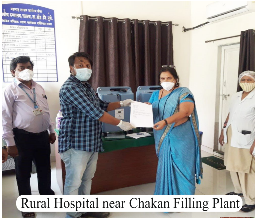
Rural Hospital near Chakan Filling Plant