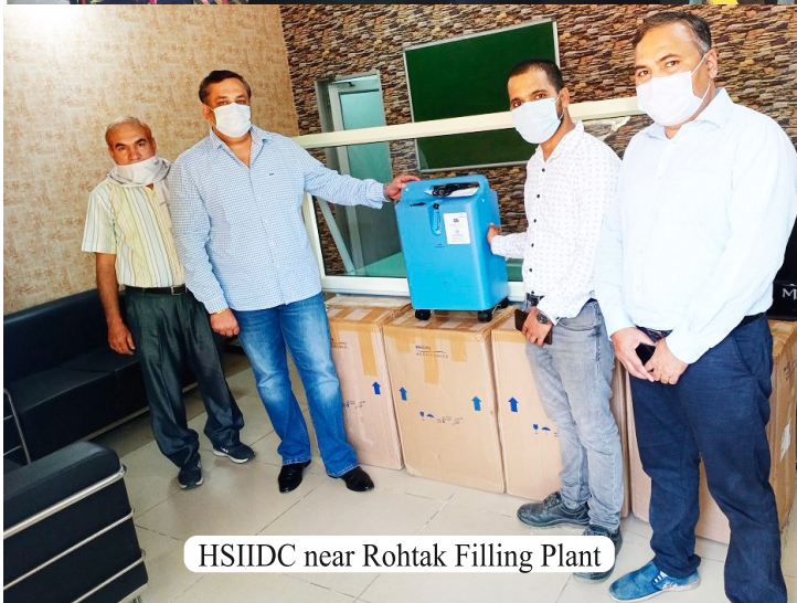
HSIIDC near Rohtak Filling Plant