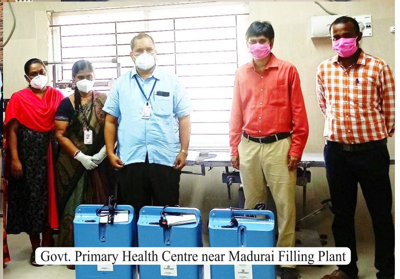
Govt. Primary Health Centre near Madurai Filling Plant