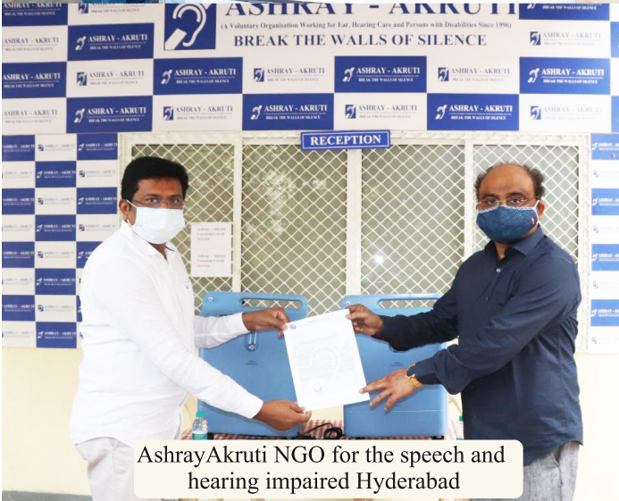
AshrayAkruti NGO for the speech and hearing impaired Hyderabad