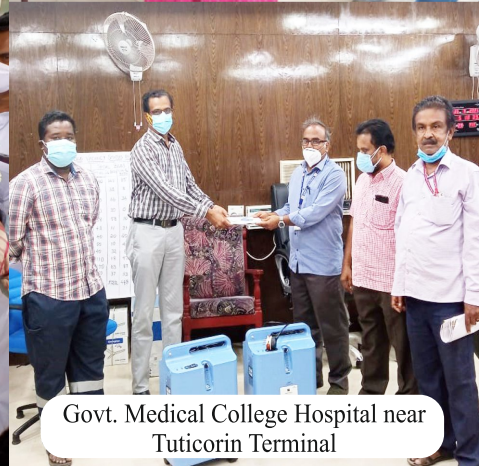
Govt. Medical College Hospital near Tuticorin Terminal