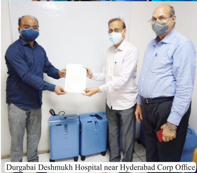
Durgabai Deshmukh Hospital near Hyderabad Corp Office