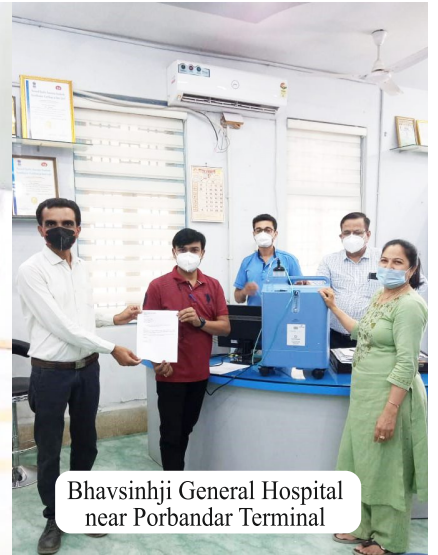
Bhavsinhji General Hospital near Porbandar Terminal