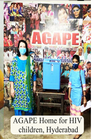
AGAPE Home for HIV children, Hyderabad