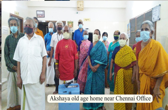
Akshaya old age home near Chennai Office