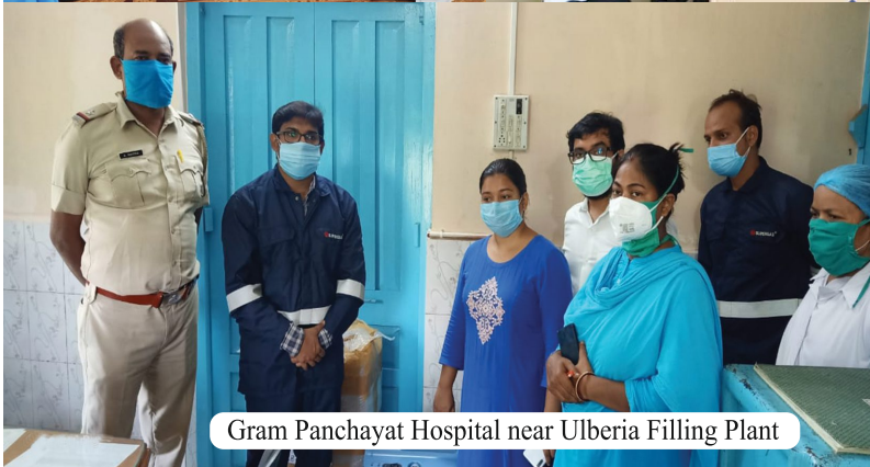
Gram Panchayat Hospital near Ulberia Filling Plant