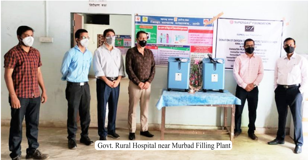
Govt. Rural Hospital near Murbad Filling Plant