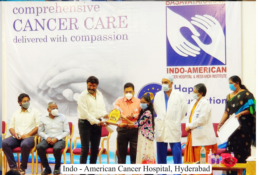
Indo - American Cancer Hospital, Hyderabad