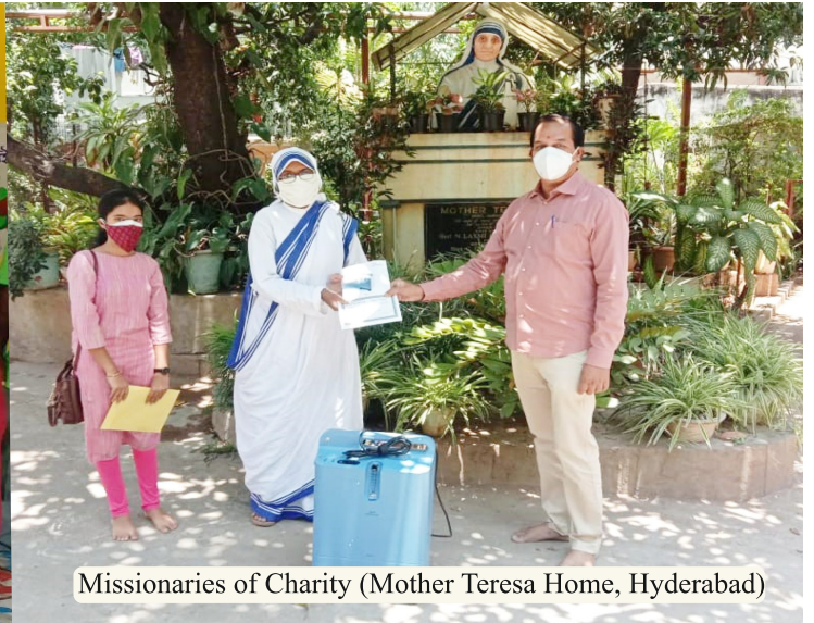
Missionaries of Charity (Mother Teresa Home, Hyderabad)