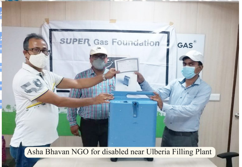
Asha Bhavan NGO for disabled near Ulberia Filling Plant