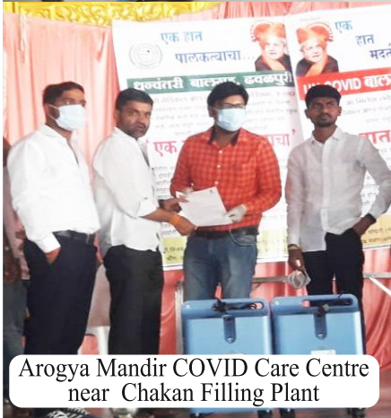
Aronya Mandir COVID Care Centre near Chakan Filling Plant