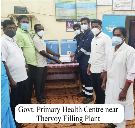
Govt. Primary Health Centre near Thervoy Filling Plant