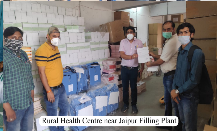
Rural Health Centre near Jaipur Filling Plant