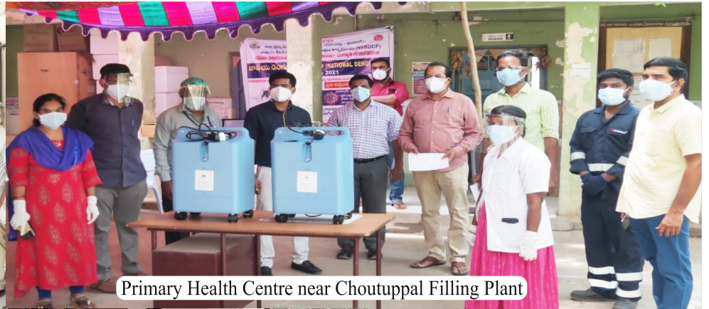
Primary Health Centre near Choutuppal Filling Plant