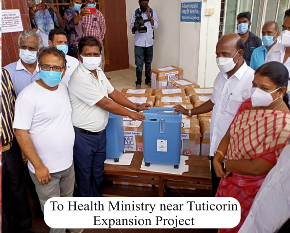
To Health Ministry near Tuticorin Expansion Project