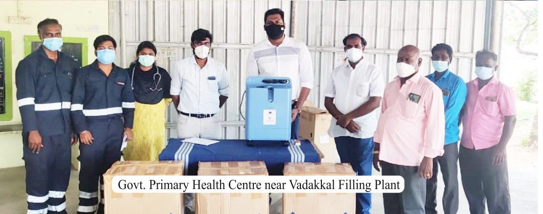
Govt. Primary Health Centre near Vadakkal Filling Plant