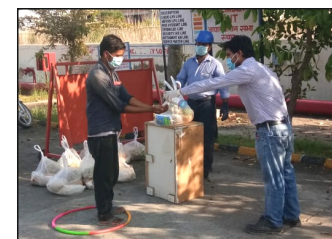
Rohtak Filling Plant