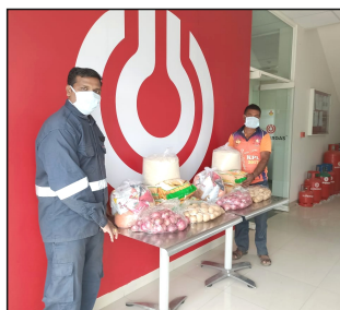
Chakan Filling Plant

SUPERGAS Foundation team has partnered with our colleagues in the regions and locations to extend a helping hand by donating grocery provisions to the slum dwellers, daily wage migrants, homeless and poorest of poor and needy communities. Our team contributed dry ration kits to 687 families, by maintaining adequate social distance and other safety precautions. The local communities, elders and villagers expressed their immense gratitude to SUPERGAS for extending a helping hand in this difficult time.