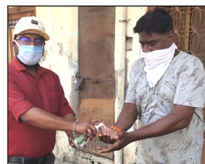
Bavla Filling Plant