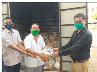
Murbad Filling Plant