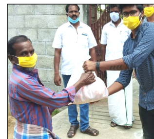
Vadakkal Filling Plant